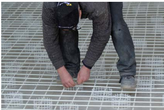
Figure 1: Installation of reinforcement

the bending load due to the load effect at the transient area between field and edge range. The insertion of a bottom reinforcing layer (1.5 cm cover) with A = 4.0 \text{ cm}^2/\text{m} was recommended to increase the safety level. Figure 1 and 2 exemplify the erection of the floor construction.