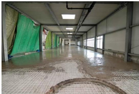
Figure 2: Pouring of concrete