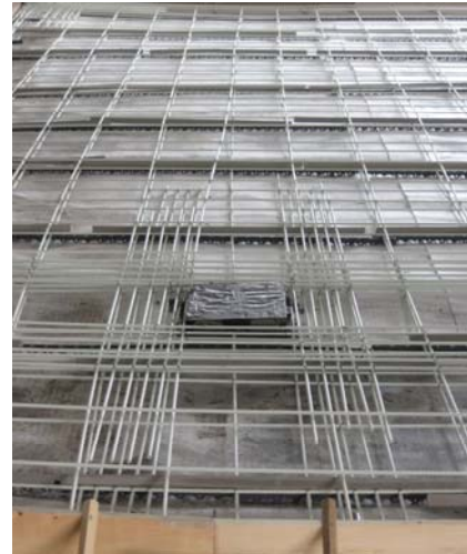
Figure 4: Installation of reinforcement